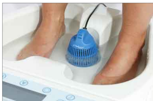
Water after foot bath with the new electrode system by 4-balance