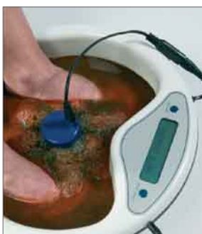
Water discolouration by traditional metal electrodes

The discolouration of the water with conventional metal electrodes is independent of whether the feet of the patient are in the water or not. The different discolourations during application are specified by the quality of the water, the water level in the bathing element, the applied saline solution, the amperage used during treatment, the water temperature, the degree of wear of the metal coils, the strength of material used for the metal coils and the metal alloy.