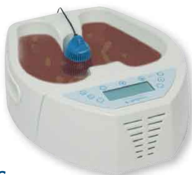
MFB 04 C

To certify a medical device in this category it is necessary to pass a rigorous EC type examination, during which the PMG Graz checks especially the safe application of the device. Apart from this the proof of the medical effects has to be furnished.